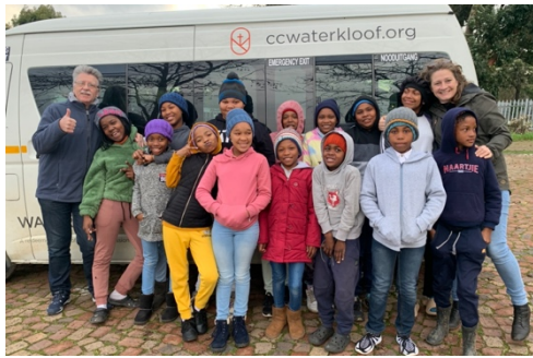
Thank you Christ Church Waterkloof for the use of the bus.

Much growth came about and these children are regular attendees at 4THE1 and have influence in the community around them. Pray that God will help them to remain in Him and to continue growing in their faith.