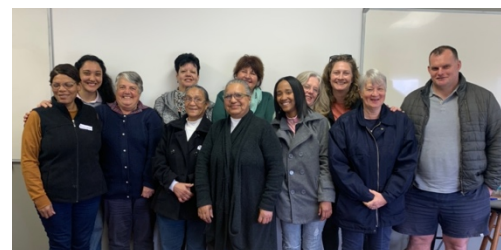
4THE1 Trauma Training