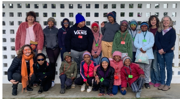
Our "Secret Agents" from Sir Lowry's Pass Village.