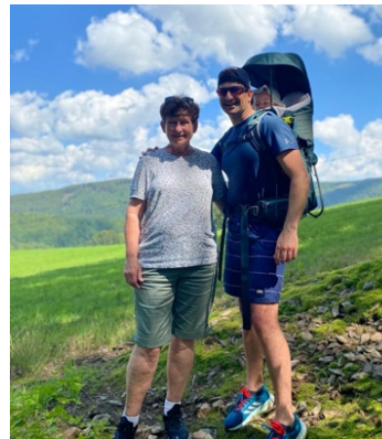
Hiking in Holland