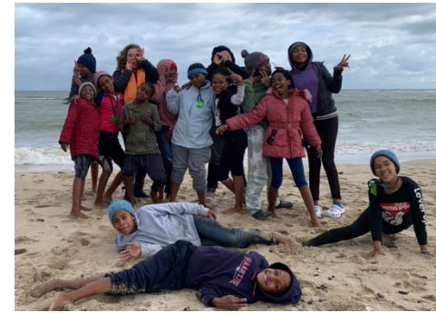
Ending off the week with hamburgers at the beach.